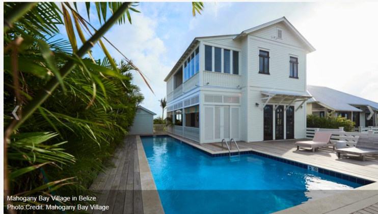
Mahogany Bay Village in Belize