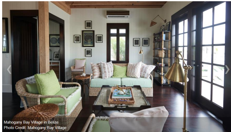
Mahogany Bay Village in Belize

Spend five minutes on Ambergris Caye (the largest island in Belize) and you'll see why the Caribbean destination is often considered one of the best vacation spots in Central America: Swatches of white-sand beaches abound, crystal-clear waters stretch on for as far as the eye can see, and weather is almost perpetually sunny and warm. Situated within a 60-acre private reserve, Mahogany Bay Village features a 205-key hotel, a marina, restaurants, shops, and—for those who want to put down roots in paradise— private residences .