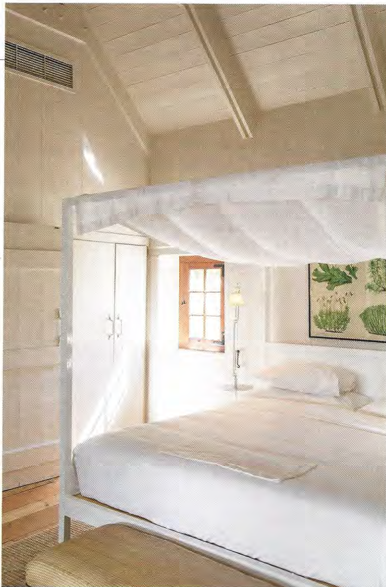
A guest room at Babylonstoren.