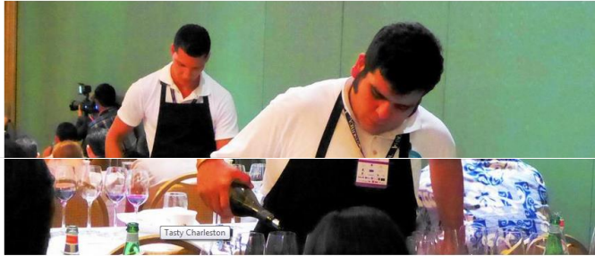
Wine-tasting at Ritz-Carlton Cancun at last year's Cancun-Riviera Maya Wine and Food Festival